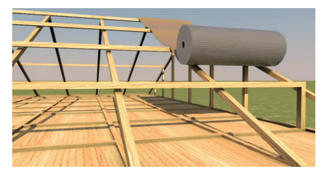
1. Roll out the Kingspan AIR-CELL <sup>*</sup> product from the ridge to gutter, over and perpendicular to the roof battens.