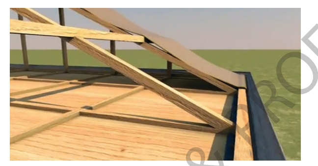
2. Ensure a 50 mm overlap into the gutter and a nominal 40 mm sag between battens is achieved.