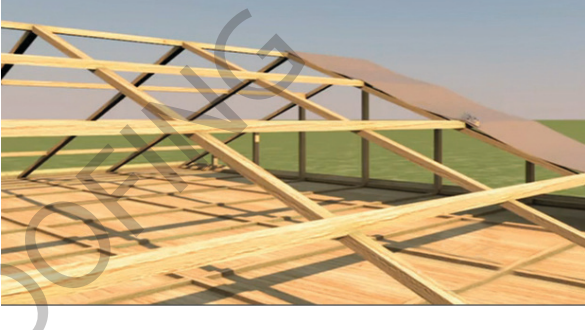
Staple or tape to battens to hold in place until roofing is fixed. Fix the metal roof sheeting onto the battens as required.

5. End joins should be overlapped by 600 mm if not taped.